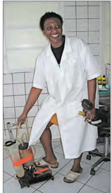
Hospitals in Africa typically have to use out-of-date equipment, like this foot-pump suction for surgery, because it's all they have. Donations from organizations like BJC to the African Health & Hospital Foundation help them provide better quality care for their patients.