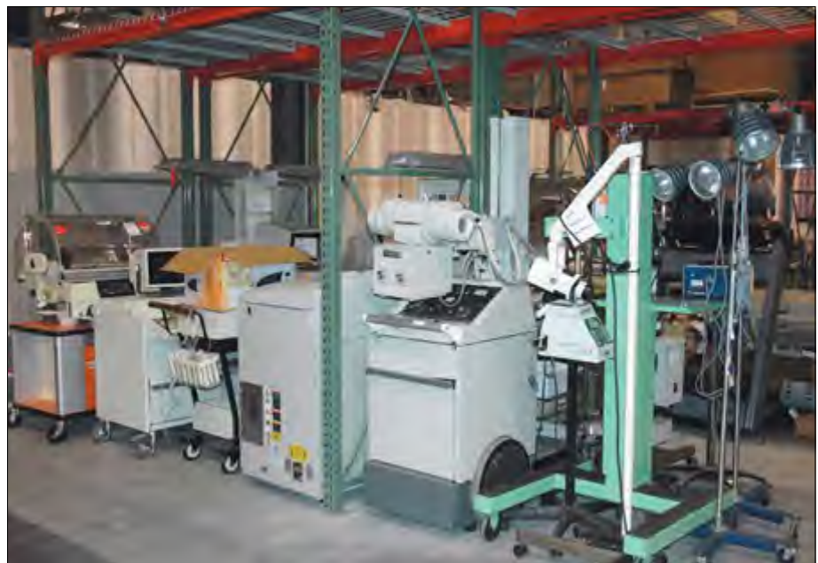
Hospital equipment is evaluated by clinical asset management staff and stored before shipment to BJC facilities, local charities, or hospitals and clinics around the world. The items pictured here will help set up a perinatal center at a hospital in Africa.